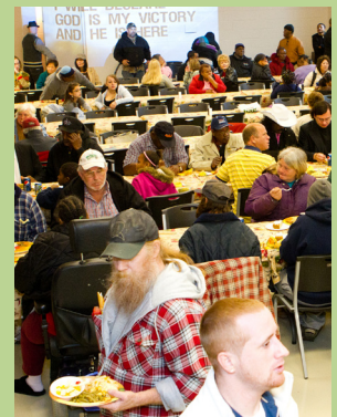
Frederick Rescue Mission