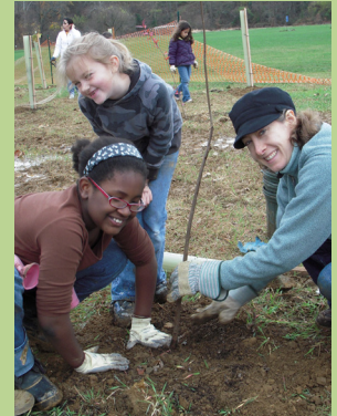
Chesapeake Bay Foundation