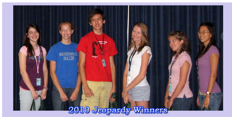
2010 Jeopardy Winners

Our 5 th Annual Student Science Jeopardy Tournament is a fun and educational event where 2-student-teams vie for prizes and bragging rights as they participate in the traditional Jeopardy “answer and question” game. Registration is required for this event, which will be held on Thursday, July 14.